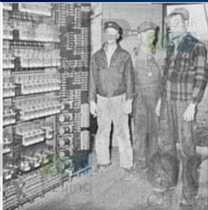
1922 - AT&T relay rack