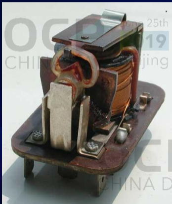
1911 - the relay